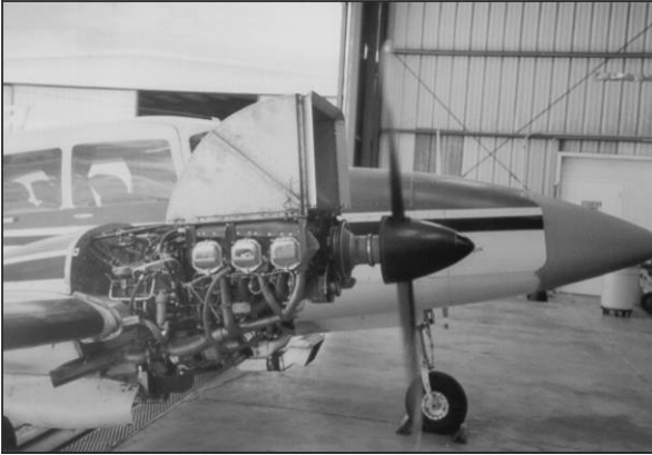
Example: Run-in using cooling shroud

addition to the risk due to test flying, overheating the engine on the ground must be considered by the overhauler/installer. In some cases of extreme engine overheating, the pistons will expand to a diameter larger than the cylinder bore, and will result in severe scoring. Overheating of the cylinder barrel during run-in is not always indicated on cylinder head temperature gauges before the damage has been done because the thermocouple is on the head rather than the barrel. Improper ring seating causes increased blow-by which heats the internal components of the engine and the oil supply. Prolonged operation with excessive blow-by can cause premature failure of cam followers and camshaft lobes.